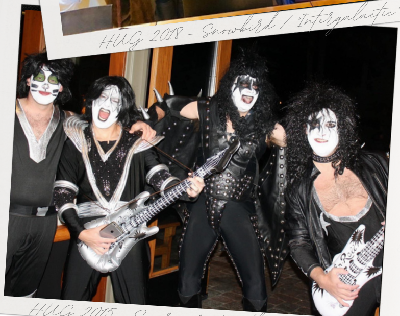
HUG 2015 - Sunriver / 25th Anniversary