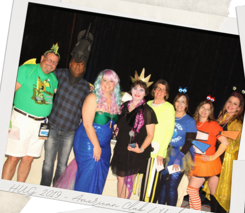
HUG 2019 - American Club / Under the Sea

If you need ideas, don't hesitate to reach out to your HUG Board Members or your SMS account manager, we'll happily throw ideas your way!