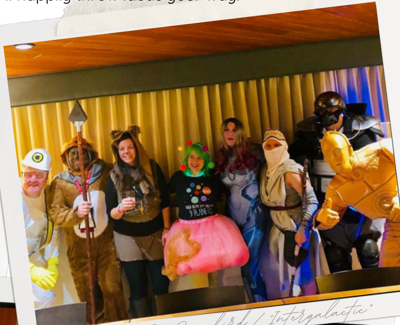
HUG 2018 - Snowbird / 'Intergalactic'