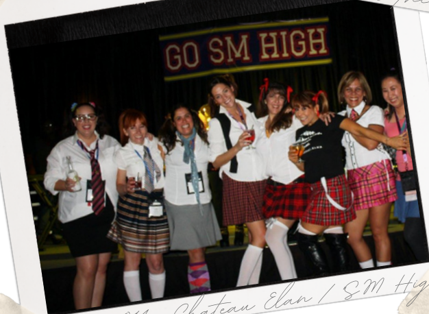
HUG 2014 - Chateau Elan / SM High